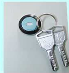
3. Waterproof Lock